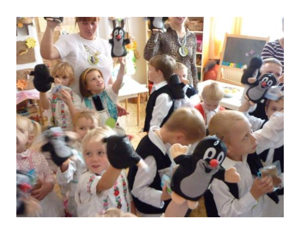
My friend, the little Mole