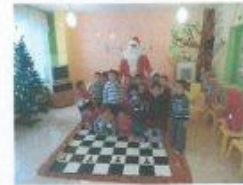
With Santa on 12/19/2012