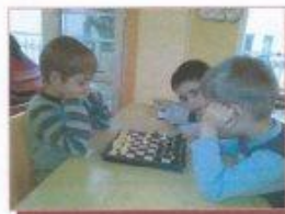
How difficult is this game!