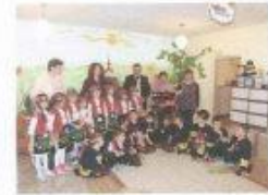
Mr. Mayor of Dve mogili bring expensive gifts for Christmas!