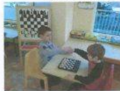
At the beginning and end of the game of chess, we salute you!