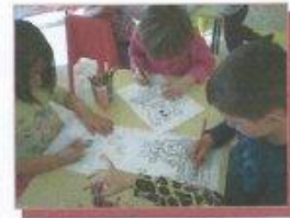
Serve with mole flowers hero