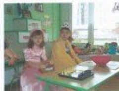
We know what the most important figures in chess!