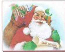
We children love you and look forward to!