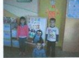
Mole learns to know the numbers