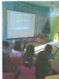
During situations in kindergarten using interactive technology.