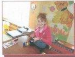
Let's make ourselves mole