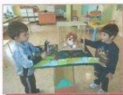
"Mole in the ZOO" - theater table