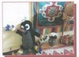
By mole in the clubs for the disabled