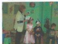
We know the chess pieces!