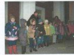
On 12/01/2012, with mole lit Christmas Tree in front of the municipal library!