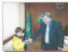
Mole to visit the Mayor