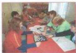
Seminar on Chess