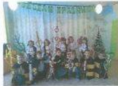
We are young survakari - customs and traditions in Bulgaria

Themes: "Mole and medicine" and "Chess for the youngest children"