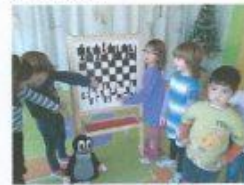
What we are interested in us and mole!