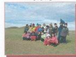
On tour with mole