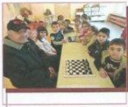
Grandfather teacher chess